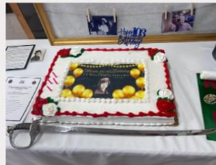
held at the Lincoln Veterans Hall hosted by Post 264 & Auxiliary Unit 264