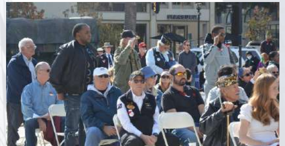
Veterans Day: acknowledging those who served