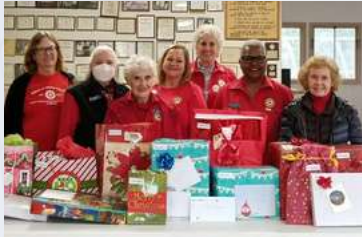
Auxiliary with 2022 holiday gifts for VA patients