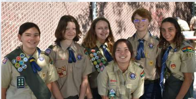
Hosted by P105, Boy Scouts Troop 10/110