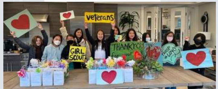
ALA: College Park Girl Scouts Troop 61740 gifts to veterans