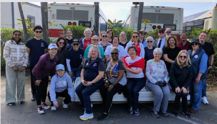
SMCBSM pack care boxes for deployed soldiers with help from ALA, Nat'l Charity League, Young Men's Service League, Foresters Financials, Sorority Xi Pi Delta, and Nation's Finest.

Mid-Dec, TBD. VA's TOYS FOR VETS. Volunteers needed to wrap gifts. Where: 795 Willow Rd., Bldg. 334 Gym, Menlo Park. Check the Legion's website for an update.