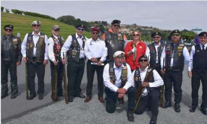
Riders & Sons at Golden Gate National Cemetery (GGNC) for Purple Heart Day 2022.

SONS OF THE AMERICAN LEGION & AMERICAN LEGION RIDERS. There is no shortage of volunteers when it comes to the Sons and Riders fulfilling weekly memorial missions for veterans. Their dedication (through rain or shine) is reflected in these numbers, from April through August. Many members qualify for both branches. Their efforts don't stop in miles; Sons and Riders have also raised funds for multiple causes.