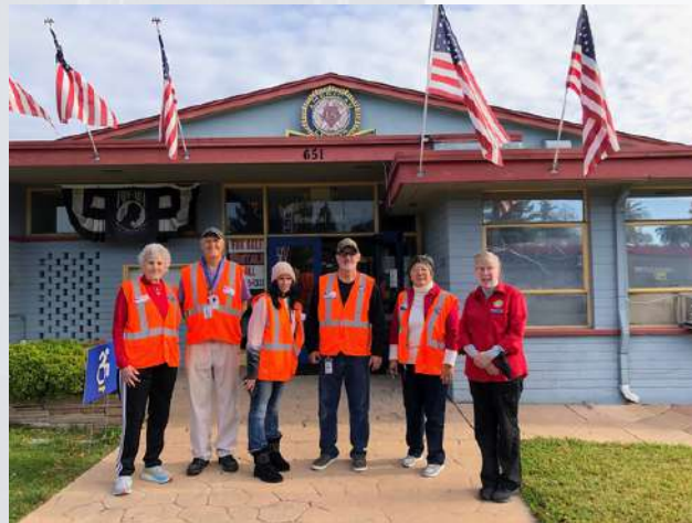
Post 105 Vote Center, November 2022