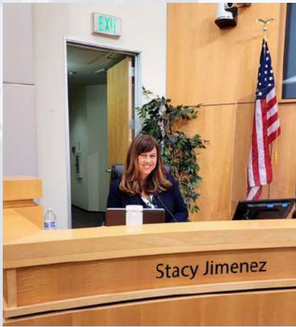
ALA member & Girls State panelist elected as Foster City Councilwoman