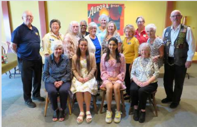
ALA Girls State Citizens meet with U105