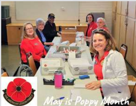
May is Poppy Month