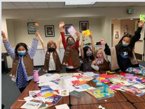
ALA: Foster City Girl Scouts Troop 61829 making holiday cards for VA patients