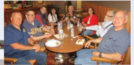
Fourth of July Parade Participants & followed by BBQ social