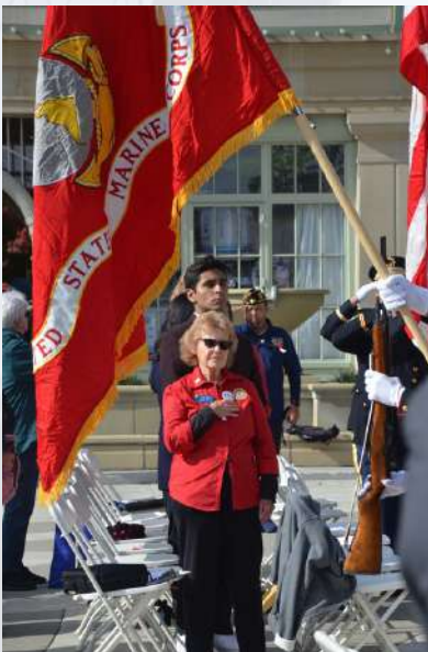
Veterans Day 2022: Concisely captured in one photograph: the Marine Corps flag and the Stars & Stripes framing an Auxiliary Member, the Boys State Citizen, and a Legionnaire.