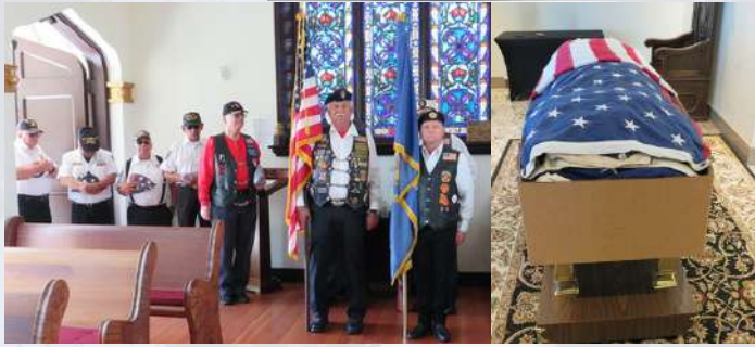
2023 Flag Retirement Ceremony, Cypress Lawn