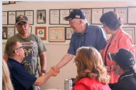
SOS Breakfast greetings