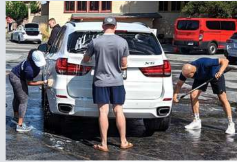
Marines 23d Reg. Carwash Fundraiser