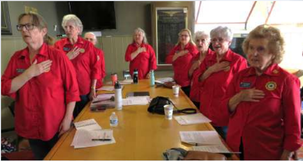
ALA meetings open with a prayer, Pledge of Allegiance, and recital of the ALA Preamble.

American Legion Auxiliary. The Auxiliary actively supports all aspects of the mission of the Legion Family of Post 105. It is our privilege to support our veterans and community. One of our main activities is working with staff and residents of Bldg. 331 at the Menlo Park VA Medical Center. Members served pizzas for a VA staff appreciation lunch. We provided residents catered lunches to celebrate the Fourth of July. In December, U105, along with the five other D26 Units, will fulfill residents' wish lists. For the VA's Toys for Vets, we'll wrap free gifts for residents to give to their families.