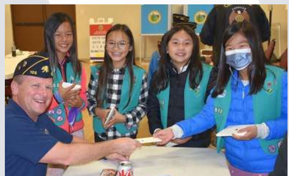
ALA: San Mateo Girl Scouts Troop 61802 honoring veterans in November