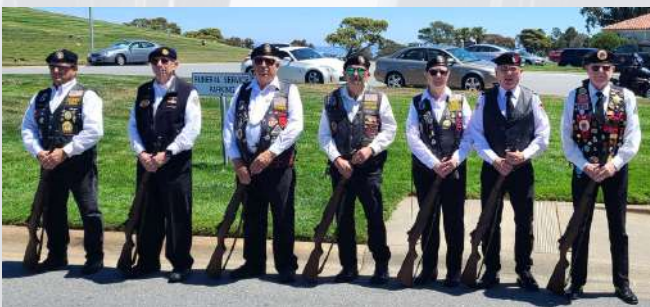
August 2023 Firing Detail for a Navy veteran's burial.

Missions to raise funds in support of veterans & military families: SF Marathon, Independence Day Parade, and SF Bay to Breaker.