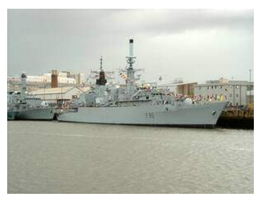
October 3, Navy Day

"Members Helping Members." Units can hold fundraisers to support this Program. Funds donated to this program will help a fellow Auxiliary member who has faced a disaster to their primary residence or has been displaced or evacuated due to a natural disaster. Donations can be made online or sent to the ALA Foundation and flagged for AEF.